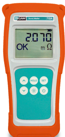
700-915 Sure Grip Cover