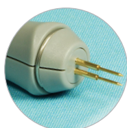
MKP Probe with "B" Style Pins Installed