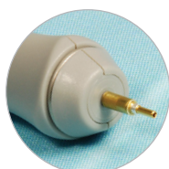
MCP Probe with "B" Style Pins Installed