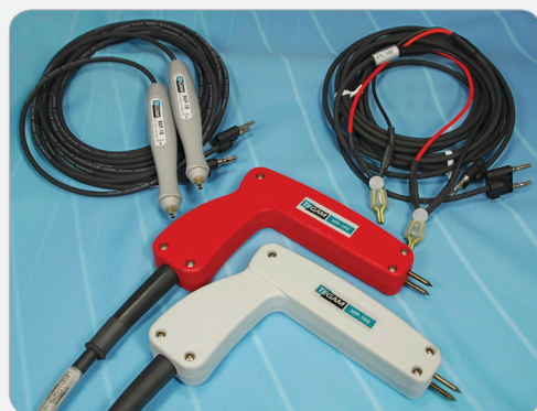
BKP-10 HTP-100 Pistol Grip KTL-100