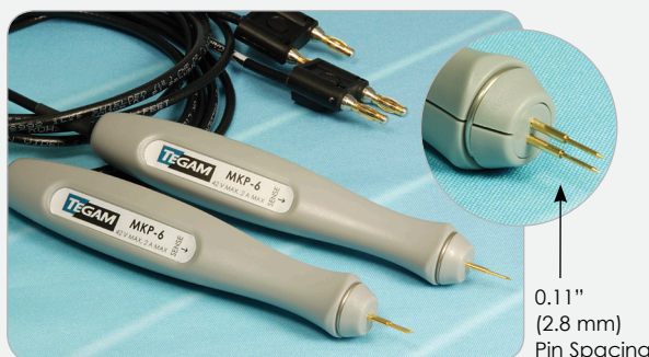
MKP-6 Probe Set with "B" Style Pins Installed