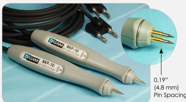
BKP-10 Probe Set with "B" Style Pins Installed