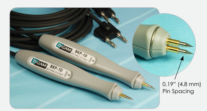
BKP-10 Probe Set with "B" Style Pins Installed