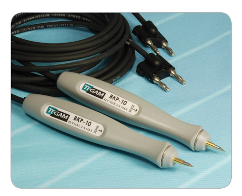
TEGAM BKP-10 Kelvin probes used to measure contact resistance between shunt and circuit board trace

Power is from internal rechargeable NiCad cells, and/or 110/220 VAC, 50/60 Hz power line. Power consumption is less than 10 W. The battery charges any time the line cord is plugged into a power receptacle. Battery charge time, from a discharged condition, is less than 8 hours for a full charge. Battery charge lasts for 140 operating hours maximum, and typically 60 hours.