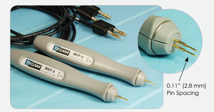
MKP-6 Probe Set with "B" Style Pins Installed