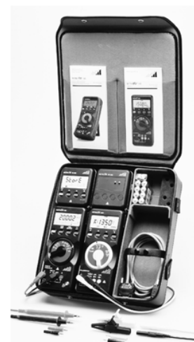
F840 (with sample contents)