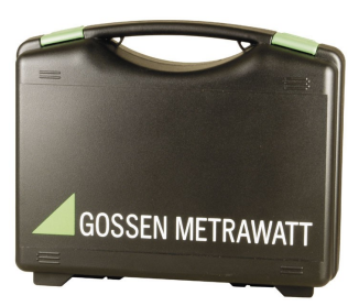
F836 Ever-Ready Case

For two multimeters (with/without protective rubber holster) and accessories