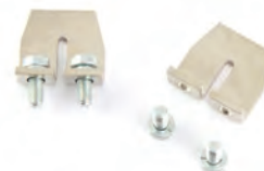
Pettine parallelo Jumper bar

25 mm 2 - 600V - 85A Passo / Pitch 12 mm