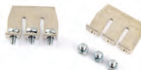
Pettine parallelo Jumper bar

10 mm 2 - 600V - 65A Passo / Pitch 9,1 mm