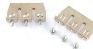
Pettine parallelo Jumper bar

50 mm 2 - 600V - 130A Passo / Pitch 16,1 mm