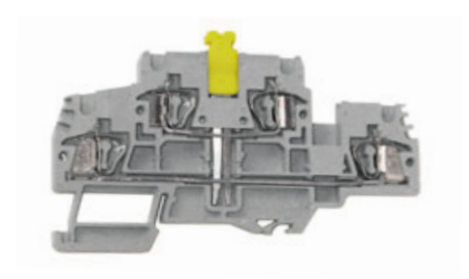
HMD.2/GR cat. no. HD100GR