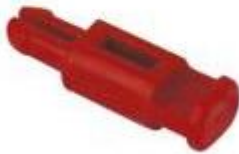
CR CDS coding pin