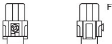
contacts side (front view)