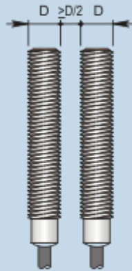
Side by side mounting