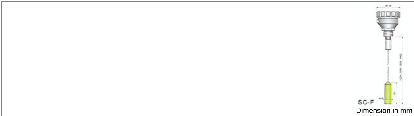
SC-F Dimension in mm

Part number: CLC000011 - Model: SC-F3000 24Vac