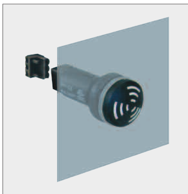
Simple connection by means of connector plug