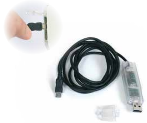
Programming kit X756894