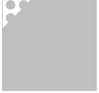
ORAFLEX® 11553 medium