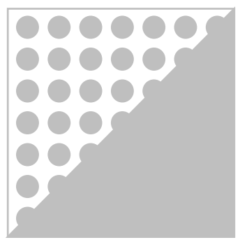
ORAFLEX® 11555 medium