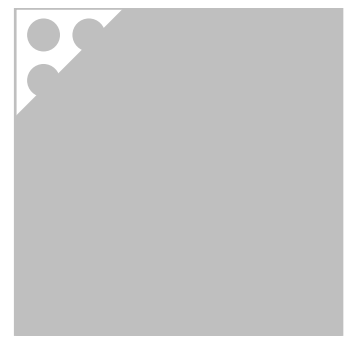
ORAFLEX® 11585 firm