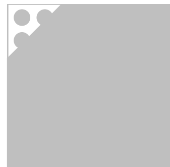
ORAFLEX® 11583 firm