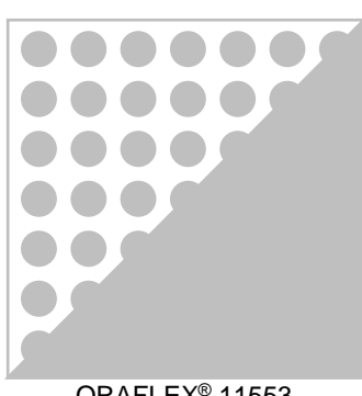
ORAFLEX® 11553 medium