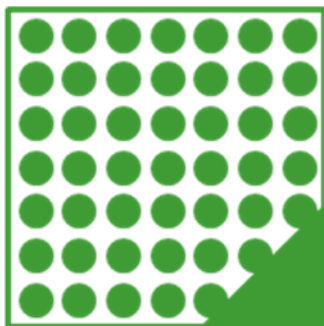
ORAFLEX® 11626 soft