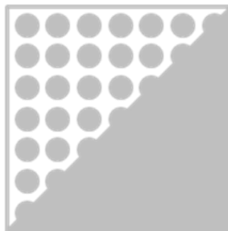
ORAFLEX® 11656 medium