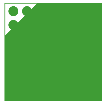
ORAFLEX® 11686 firm