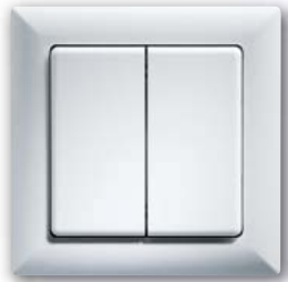
Pushbutton with double rocker