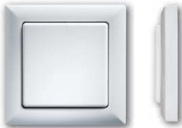
Pushbutton with rocker